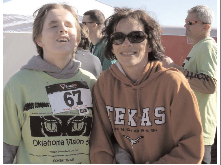
Blind student from Muskogee School for the Blind who was a runner in the Lawton Patriot Club's 5K run.